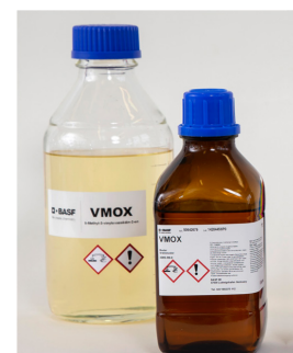
Figure 1: VMOX structure and GHS pictogram comparison with other monomers

but there are inherent chemical properties, such as odour, that are also very important to those handling chemicals and using formulations. Even after printing, VMOX-based formulations are virtually odourless. To expand the scope beyond use in UV inkjets, VMOX testing has demonstrated success as a reactive diluent in UV coatings, UV adhesives and 3D printing applications.